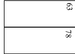
Boards 63 & 78

VICTORY CONDITIONS: The Russian Player wins at game end if there are no good order Hungarian units on or adjacent to a level 3 Hill location on board 78.